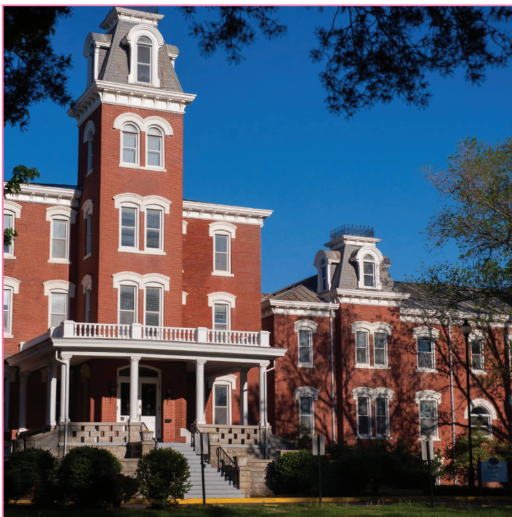
Historic Main Hall - built in 1884