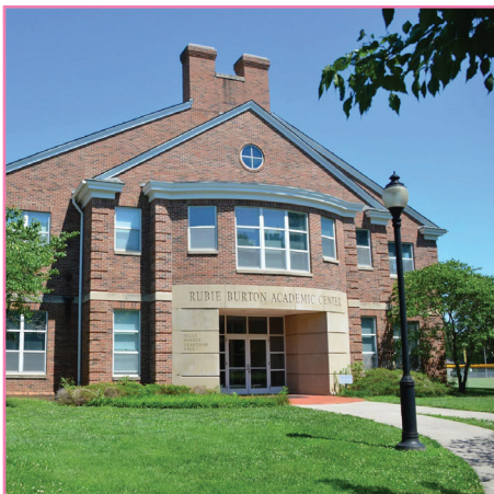
Rubie Burton Academic Center