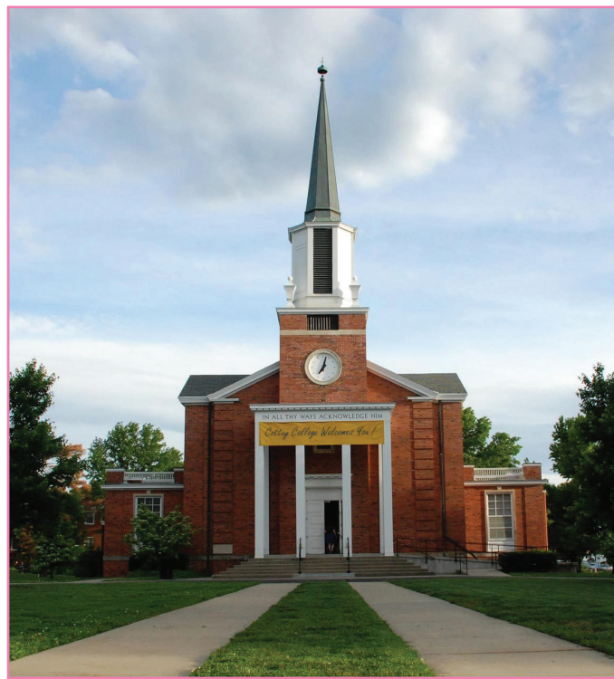
Cottey College Chapel