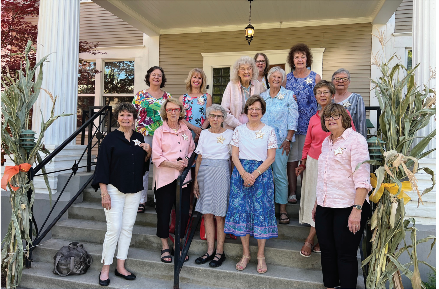
Pictured above is Boise Chapter AJ, during their recent visit to the Chapter House.