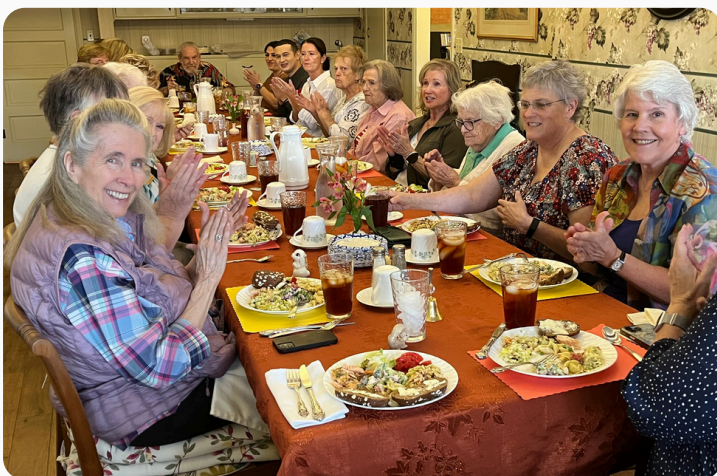
Board members, residents and employees enjoy lunch together